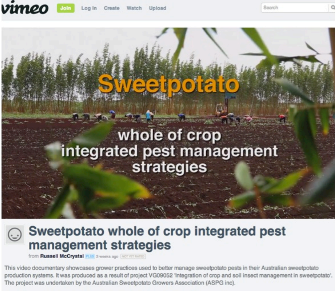
Figure 4.1: Sweetpotato whole of crop integrated pest management web video title page.

minute WOCIMS video documentary is hosted on VIMEO (Figure 4.1) and can be found at weblink: https://vimeo.com/92479777 (Password: VG09052). The complete transcript has been included and is presented in Table 4.2.