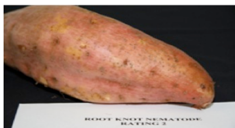
Figure 2.1: Category 2 defect to skin - pimples