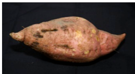
Figure 2.3: Category 3 defect to skin – galling and cracking